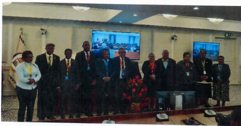
Figure 4 Members of SIDS present at the meeting

The SIDS meeting was initiated with the objective of revitalizing the group within the margins of the IPU, as explained by Mr. Speaker in his welcoming remarks to the SIDS in attendance who were namely Fiji, Tonga, Tuvalu, and Cabo Verde. Initialised and chaired by the Seychelles