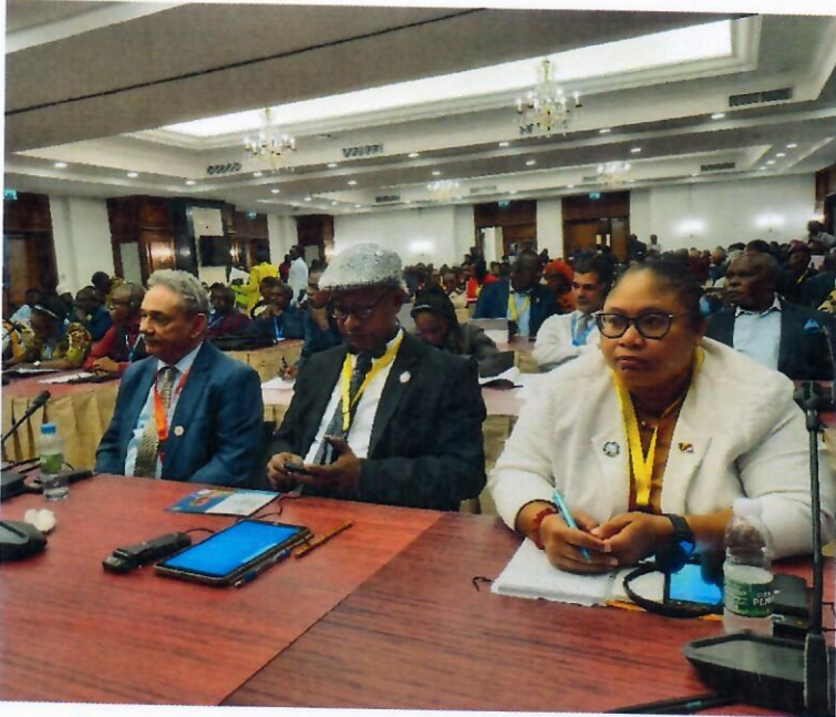
Figure 2 The Seychelles delegation at the All Africa geopolitical group meeting

Heads of delegation, the previous day. They agreed that they would unanimously endorse this proposal in the Africa Geopolitical group once brought forth by Algeria. In the Africa Group meeting, Algeria brought forth the proposal on the Gaza humanitarian crisis which was unanimously supported where it was also proposed that Algeria jointly draft the emergency item with South African.