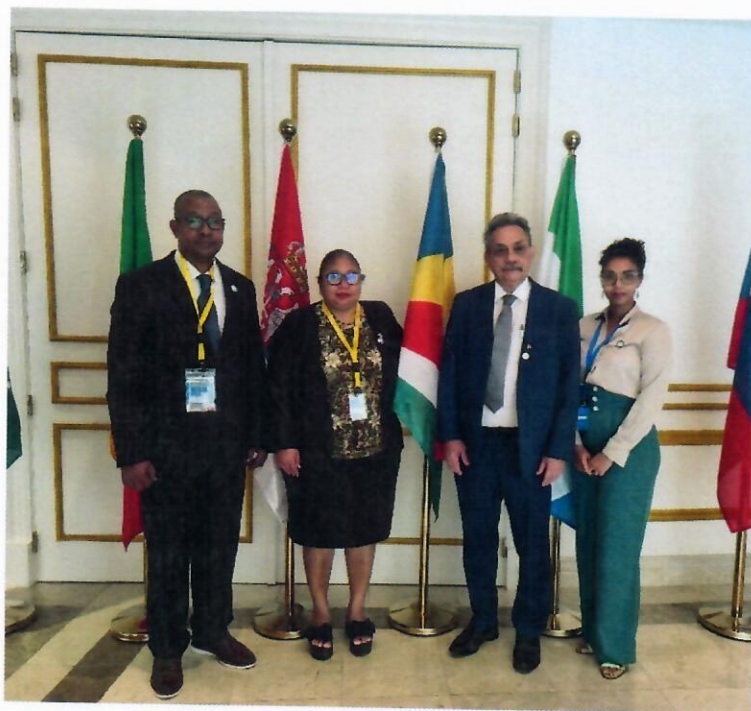
Figure 1 The Seychelles delegation posing with Seychelles flag

The proceedings of the General Assembly officially began on Monday 23 rd October 2023 to last until Friday 27 th October 2023. The delegation however, began attending meetings since Sunday 22 nd October Friday 10 th March 2023. These were meetings of geopolitical groups namely the Southern African Development Community (SADC) and the African geopolitical group.