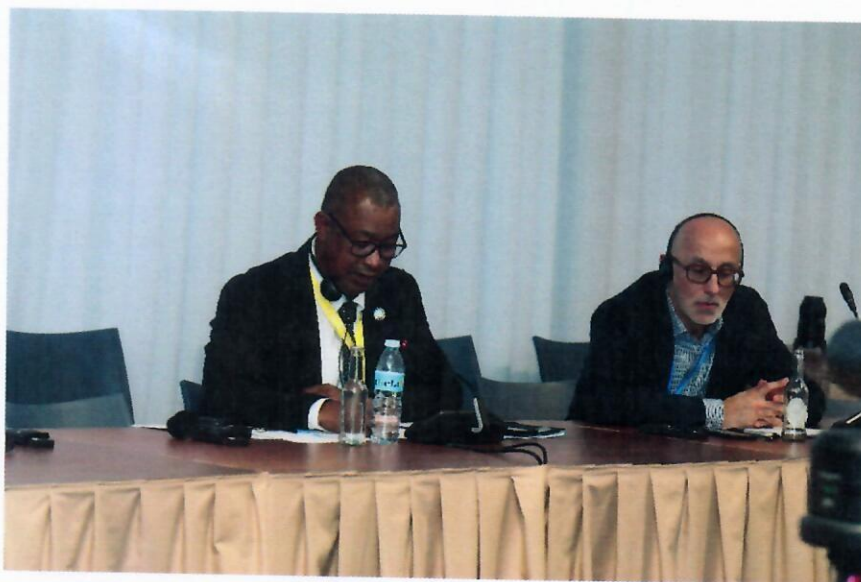
Figure 3 Hon. William accompanied by the Secretary to the SDC

Hon. William shared that the Sustainable Development Committee would be debating on 'Ensuring global food security' which will include the participation of experts from the World Food Programme and the African Union. He informed that the committee would continue exploring the key linkages between climate change and sustainable development and peace and security in its work.