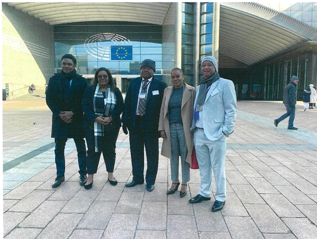
The delegation at the European Parliament