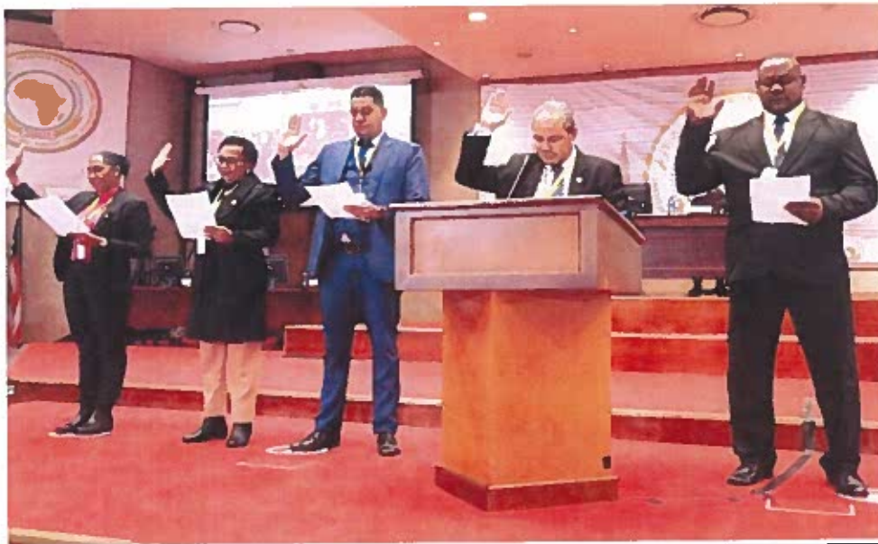
The delegation of the National Assembly of Seychelles taking their oath on 28 th June, 2022.