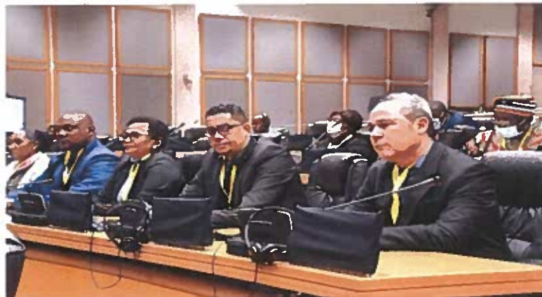
The delegation of the National Assembly of Seychelles attending election and swearing-in of President and Vice President of Pan-African Parliament.