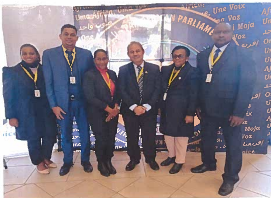
The delegation of the Seychelles at the Sixth Pan-African Parliament Ordinary Session.

The Session was mainly for the election of the new Pan African Bureau and Committees which are part of the Institution and for the adoption of the Committee's workplan. Members were officially sworn in and confirmed their participation as Member of the Pan-African Parliament.