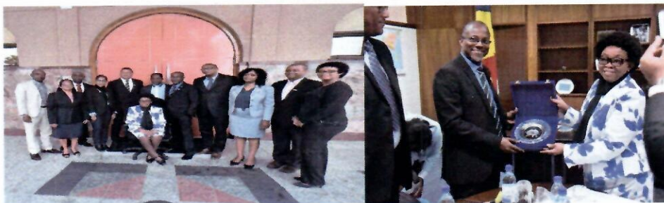
The delegation took an official photograph with the Speaker of the Botswana parliament.

The Speaker of the parliament of Botswana thanked Seychelles for choosing Botswana for the benchmarking visit and provided the members with a brief history of the parliament of Botswana. The Speaker informed the Members of her retirement in October with the dissolution of Parliament, pending legislative elections.