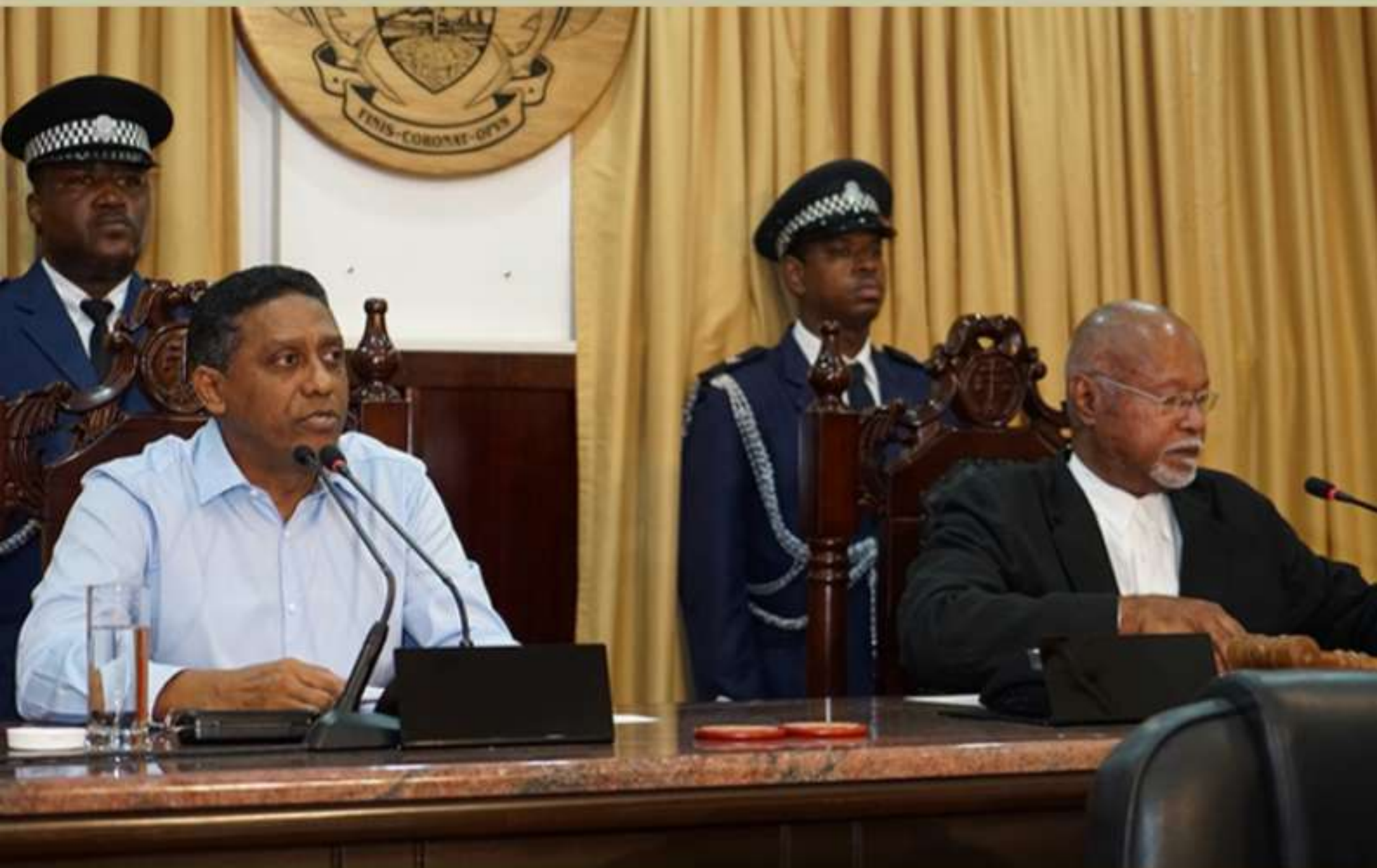
President Faure has historically addressed the House three times over the past year, making it the first time in the history of the National Assembly of the Third Republic that a President addresses the House more than once.