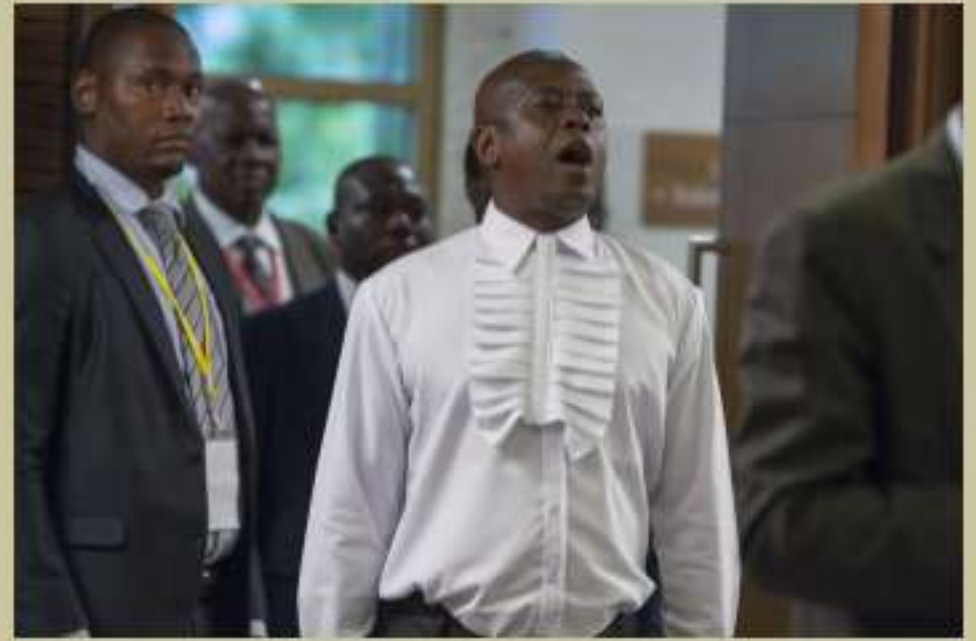
The Serjeant at Arms leads the Speakers Procession at the 41st Plenary Assembly of the SADC Parliamentary Forum at the Savoy.